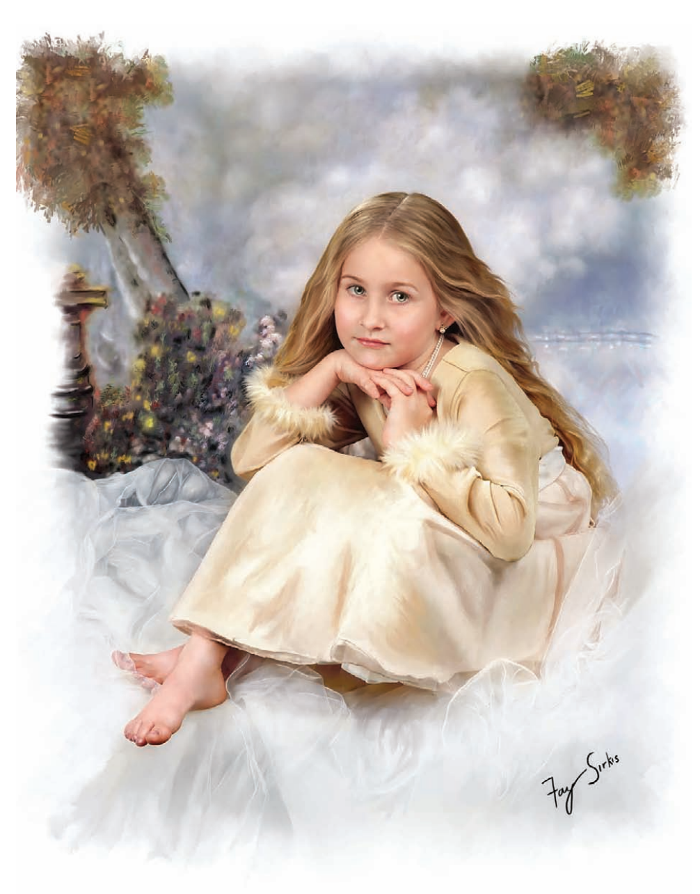
Art by: ©Fay Sirkis

fading to extend the longevity of a printed image. The polymer also helps the ink to adhere more evenly and securely across the surface of the media to reduce graininess, resist scratching, and minimize bronzing—so prints look great from every angle.