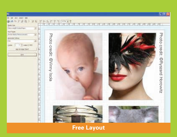
*Please see specifications page for OS compatibility.