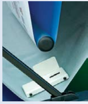
Contact-free sensor. The sensor positioned below the loop works without direct contact.