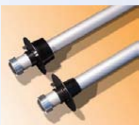
board: Cone adapters with take-up reel for 2" and 3" cardboard cores.

· Unwind the material directly: Position the optionally available release levers horizontally and fix them the media can be unrolled.