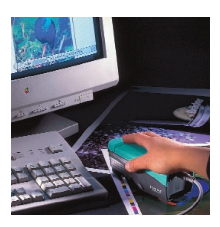
Simple and accurate:

The shielded positioning attachment allows Spectrolino to be positioned exactly for precise hand measurements.